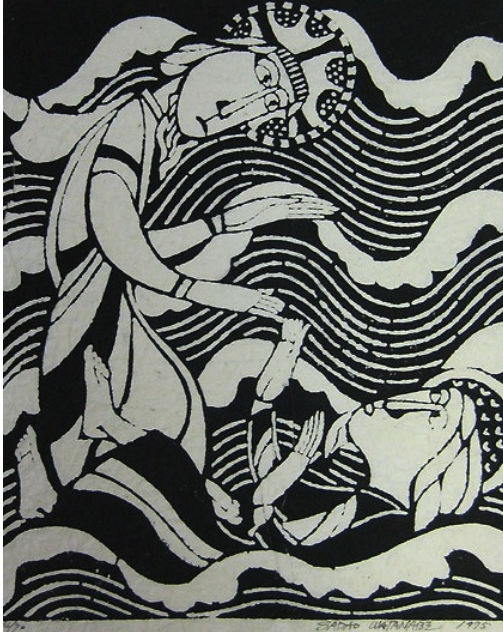
"Help me, my Lord" - By Sadao Watanabe

Sunday, February 5, 2012 Season of Epiphany We welcome you in the name of Christ.